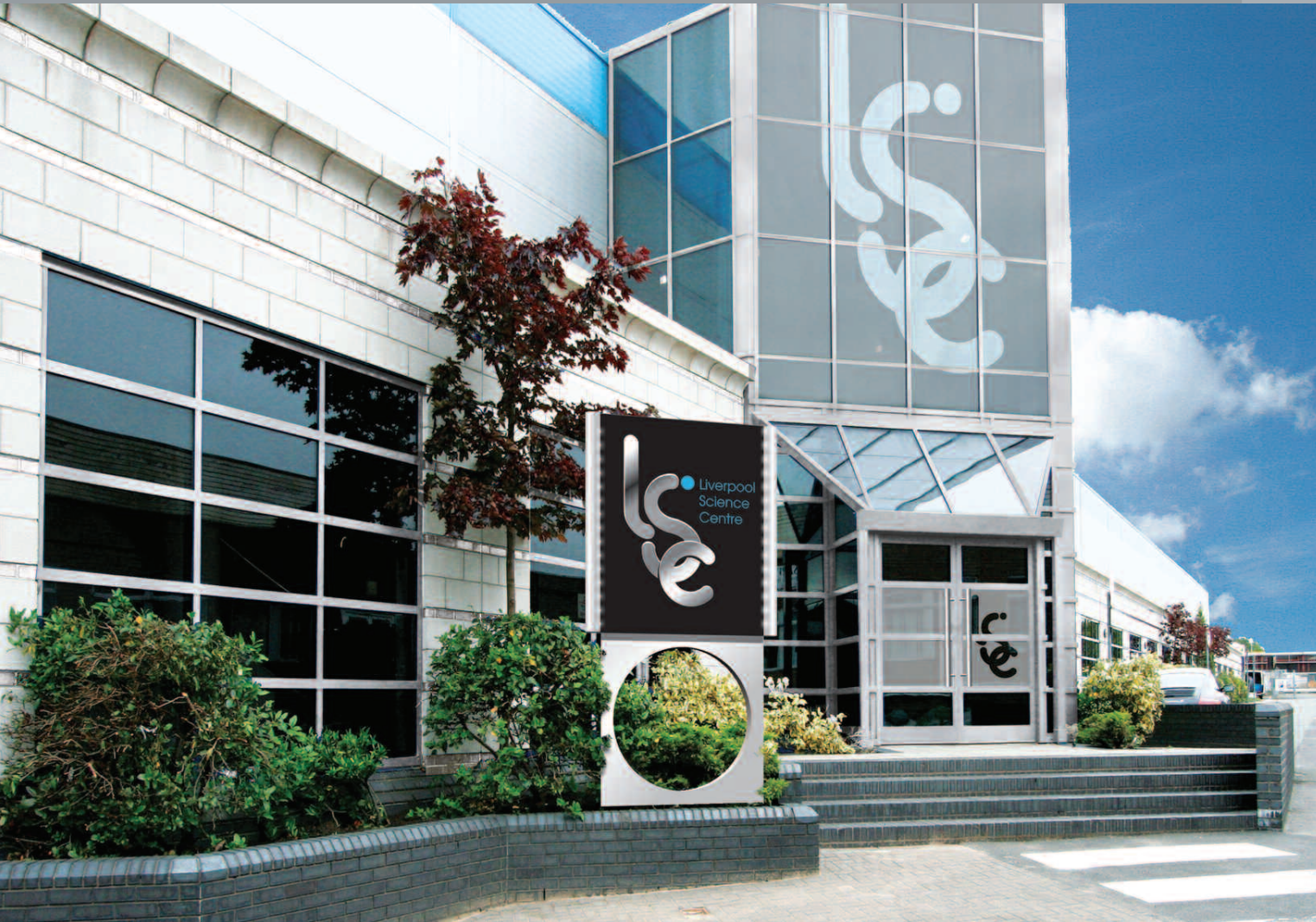
Liverpool Science Centre Southern Gateway, Speke, Liverpool L24 9HZ